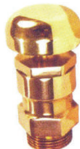
G. M. Air Release Valve