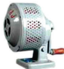
Hand Operated Siren