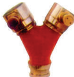
G. M. Dividing Breeching