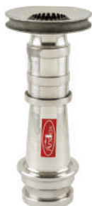
Triple Purpose Nozzle